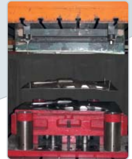
Door inner part, AA 6016, s 0 = 1.0 mm; 1,000 parts