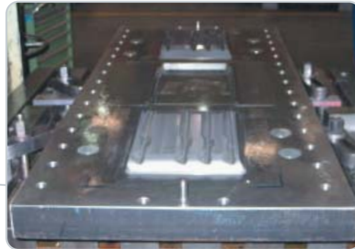
Using tooling resin inserts provides maximum flexibility and minimum cost.