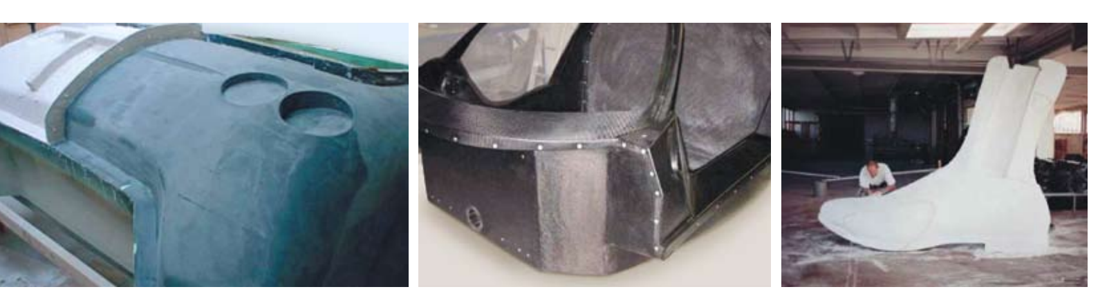
Design model from block material